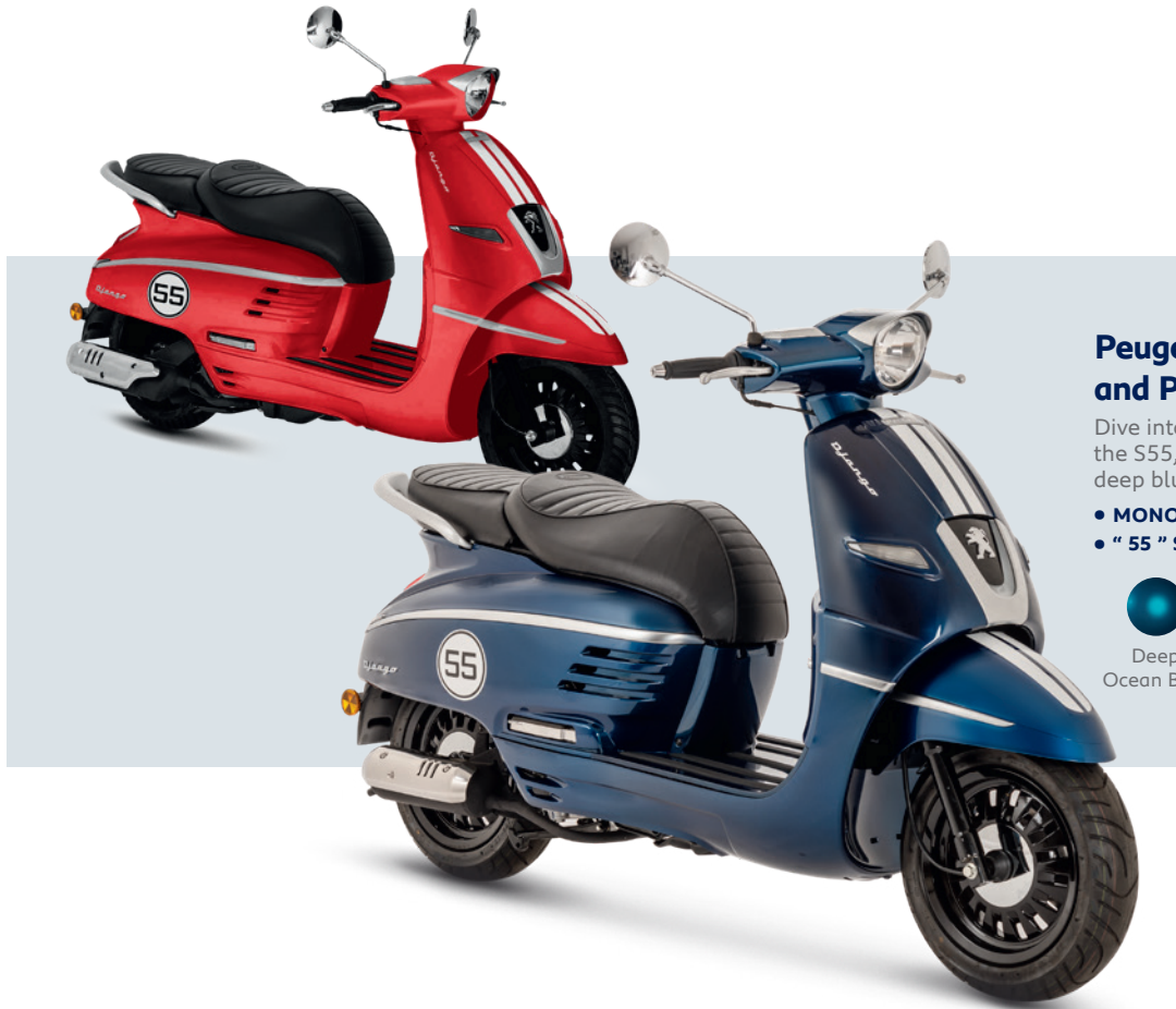
Chrome body panel